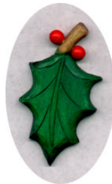
Holly Pin or Ornament